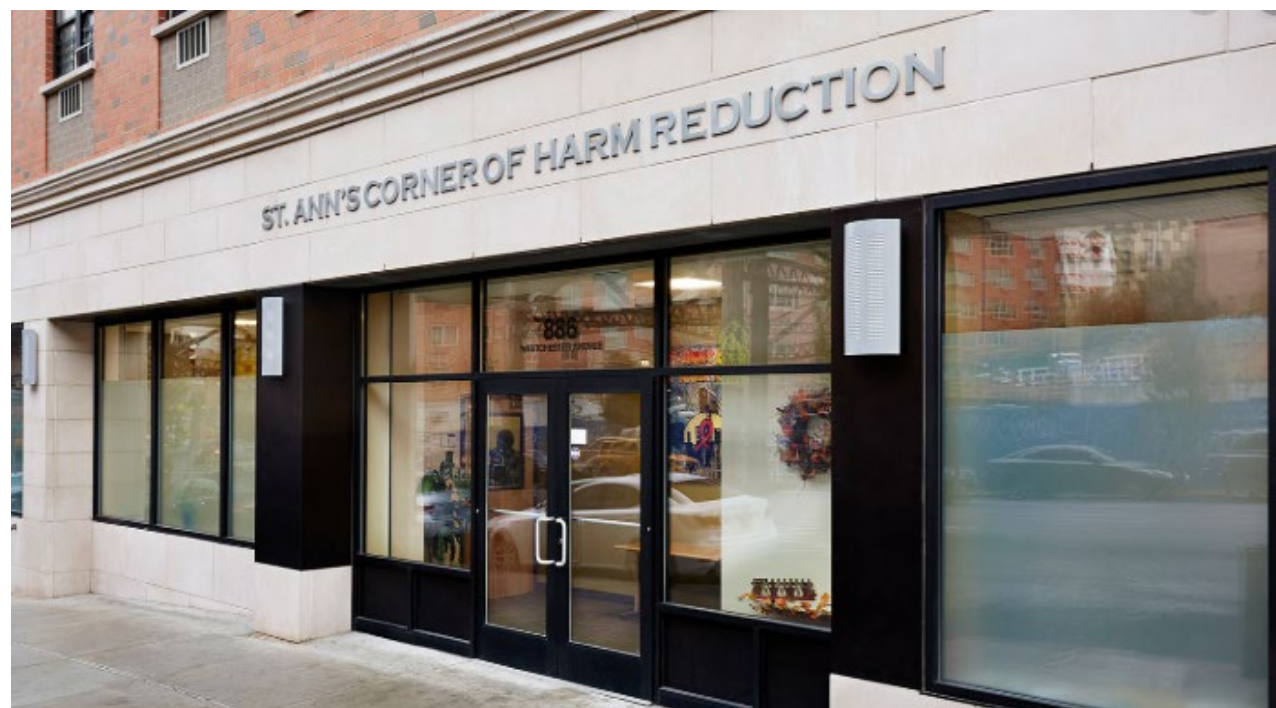
24/7 Drop-In Center