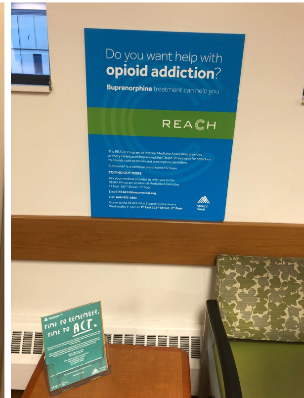
In clinic waiting room