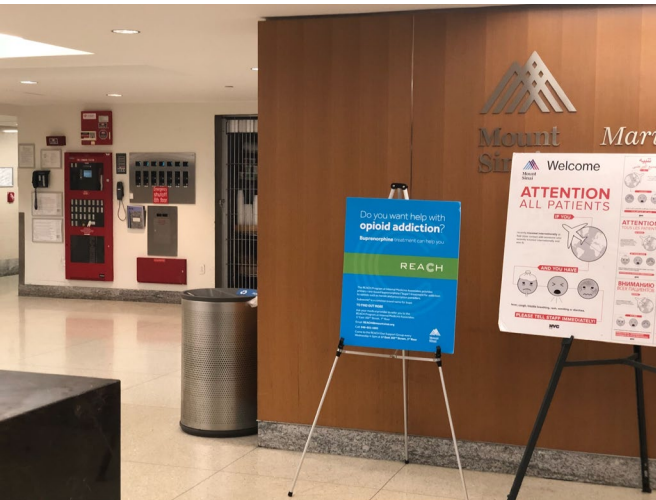
Entrance to the building