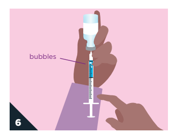
Gently tap the syringe with your fingers until the larger air bubbles rise to the top. Slowly push the plunger up a little to force the large air bubbles out.