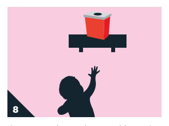
Cap your sharps box and keep it away from children. When your sharps box is full, bring it to a Needle Exchange Program or AIDS Action Committee.