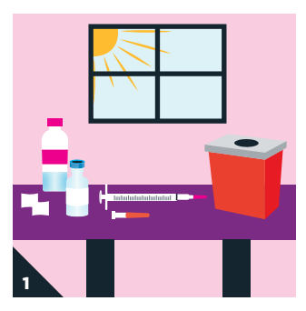
Find a clean space with lots of light to set up your equipment.