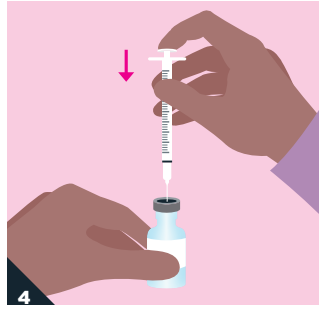
Insert the needle straight down into the center of the bottle. Push the plunger of the syringe all the way down.