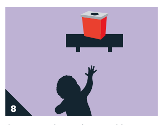
Cap your sharps box and keep it away from children. When your sharps box is full, bring it to a Needle Exchange Program or AIDS Action Committee.