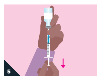
Turn the bottle upside down. Slowly pull back the plunger to fill the syringe with the medication. Check that you have the right dose.