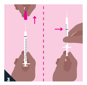
Pull the needle cover straight off the syringe. Pull back the plunger to the number on the syringe that matches your dose.