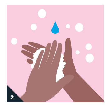
Wash your hands, and the area where you will inject, with soap and warm water. This is really important for keeping you healthy!